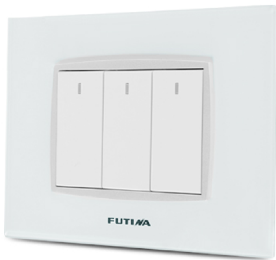
[ Flat rocker ]