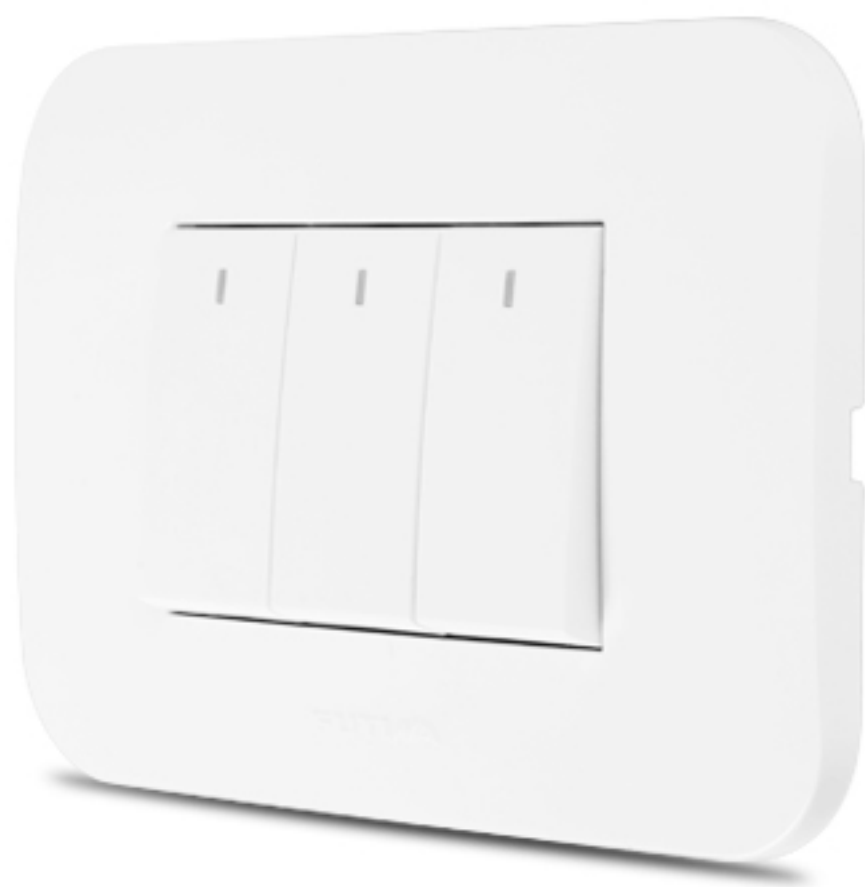
[ Traditional rocker ]

Two kinds switch for options, Flat and Rocker.